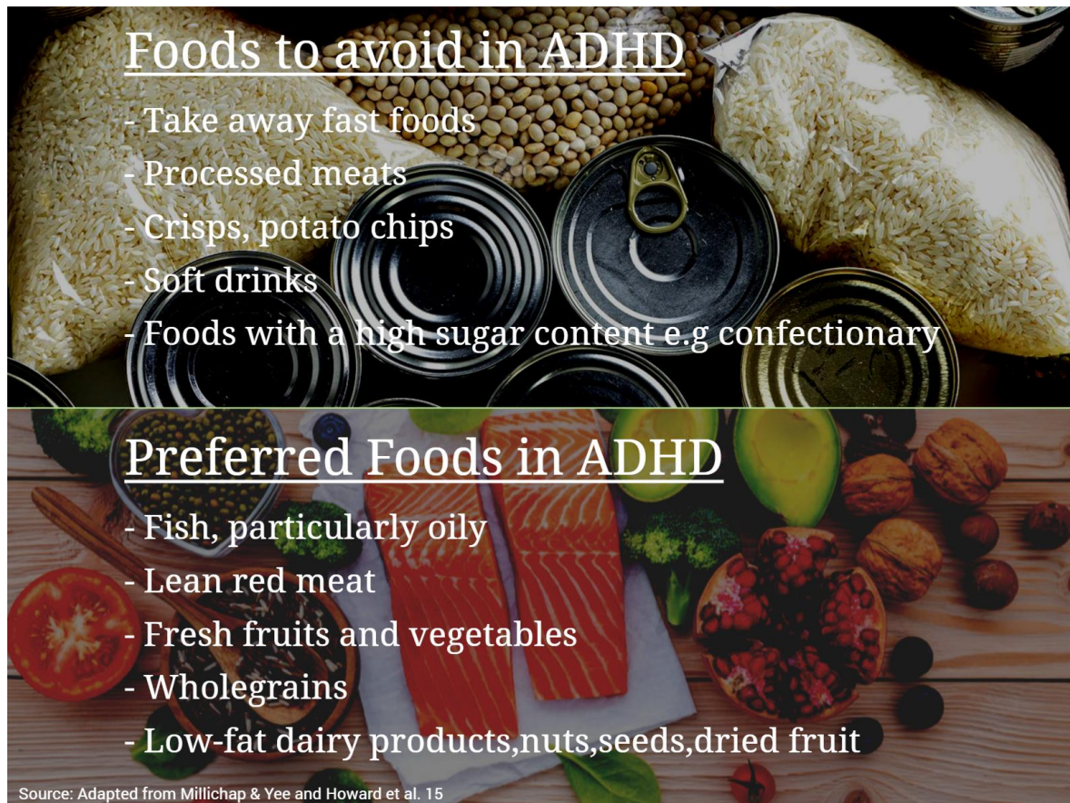
Figure (3): toxic and preferred foods in ADHD