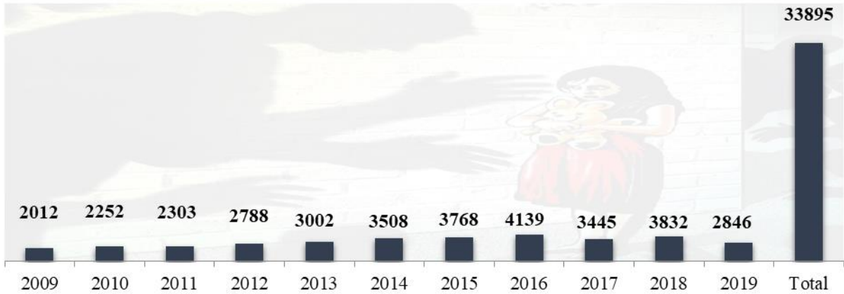
Statistics of CSA - Last 10 Years

The statistics appended below shows that the percentage of girls being harassed are much higher than boys, which reflects the reality that girls have always proved as an easy target being lesser capability to retaliate. It has also been confirmed by the American Psychological Association (APA) that Girls tend to be at greater risk of sexual victimization than boys. Boys are more likely to be victimized by a perpetrator outside the family than girls. In the year 2012 out of all 2788, 71% were girls and 29% were boys, in 2013 67% were girls and 33% were boys, in 2014 61% were girls and 39% were boys, in 2015 52% were girls and 48% were boys, in 2016 58% were girls and 42% were boys, in 2017 60% were girls and 40% were boys, in 2018 55% were girls and 45% were boys whereas in 2019 54% were girls and 46% were boys.