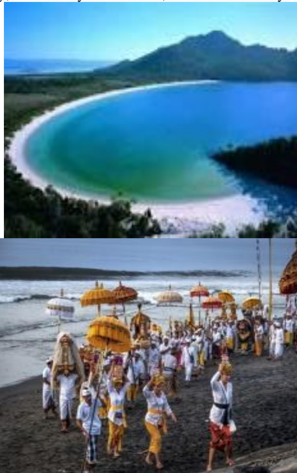
Figure 1.1 The uniqueness and beauty of nature and culture in Bali, Indonesia.

The only resources in the area, as shown in Figure 1. Take advantage of the area, culture, uniqueness, authenticity, community friendliness, and natural beauty.