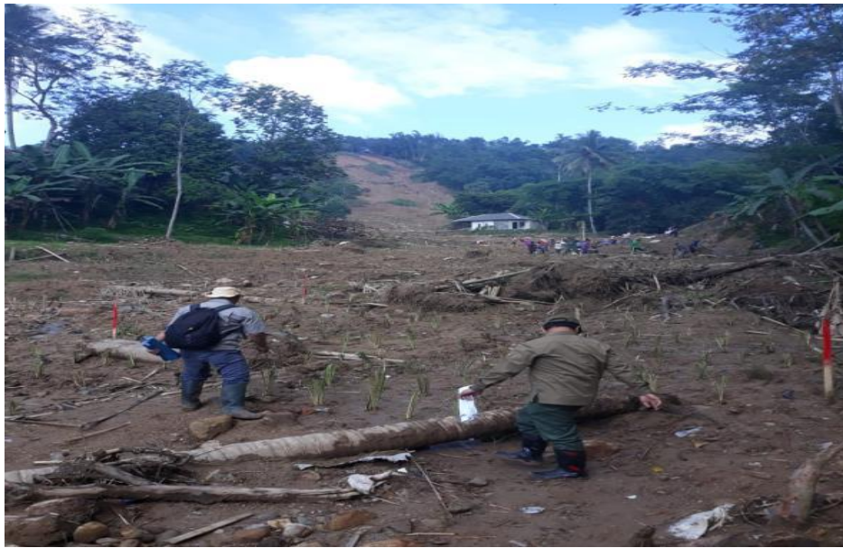
Fig. 1. Landslide in Harkatjaya Village

With the community's ability to know, understand, and be aware of the landslide disaster, the negative impacts of landslides can be identified, namely a) direct damage to public facilities, agricultural land, or human casualties; b) Indirect damage is the dysfunction of transportation so that there is no distribution of goods and services in and out, and communication is cut off, power outages, thus increasing difficulties for the community to meet their daily needs. In the end, everything will hamper regional development programs for the welfare of the community, which is in accordance with the prediction of Hardjowigeno (2007), that disasters will have a negative impact in paralyzing development activities and economic activities in the disaster area and its surroundings.