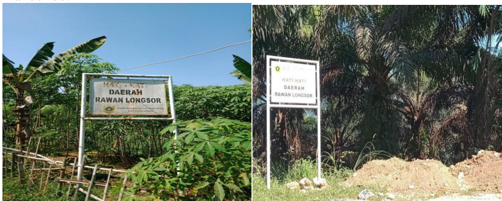
Fig. 3. The Signs of Landslide's Prone

Evacuation routes for landslides have not been officially established. However, according to the Acting Head of Village, signs or boards for disaster-prone areas on each steep hill have been socialized. Upon agreement with several village staff, it was hoped that the location of the evacuation route would be far from people's homes and easy to reach and must be far from the reach of landslides from falling. Even though they are looking for a location that is really suitable for an evacuation route, the community already understands and is aware of the importance of installing an evacuation direction fund path if at any time there is a flood and another landslide.