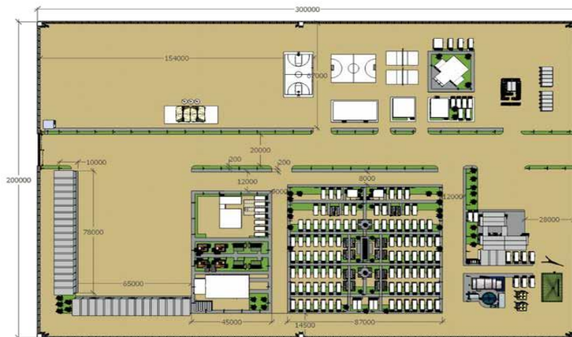
Image 4 Landscape of Garuda Camp

Garuda Camp also has 29 rooms which have each respective function. Referring to Newman's approach regarding defensible space, the layout of space and territory must produce a clear delineation between public, semi-public, private and semi-private spaces (Reynald & Elffers, 2009). According to an interviewee who became the contractor (K1) of Garuda Camp, the physical design at that time was only designed for semi-private boundaries that did not interfere with the security and comfort of the troops there. However, according to Newman, clear boundaries are needed for certain rooms, because they have an impact on adjusting the security strategy for each of these rooms.