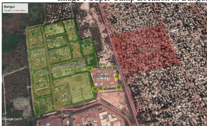
Image 1 Super Camp Location in Bangui, Central Africa

MINUSCA's Headquarters is in the Bangui City, Central African Republic in the middle of a cluster commonly known as the UN Super Camp. The complex has a territorial boundary in the form of a fence and a trench that surrounds its territory and is equipped with a complex entrance gate guarded by the designated officers. Garuda Camp is outside the cluster, even though it is exactly adjacent to the outermost fence of the super camp. Separated by a road, Garuda Camp MINUSCA borders a village of residents known as the village of criminals. This becomes a vulnerable point for the camp security which is one of Indonesia's representations, besides the camp owned by peacekeepers from the Indonesian National Army (TNI).