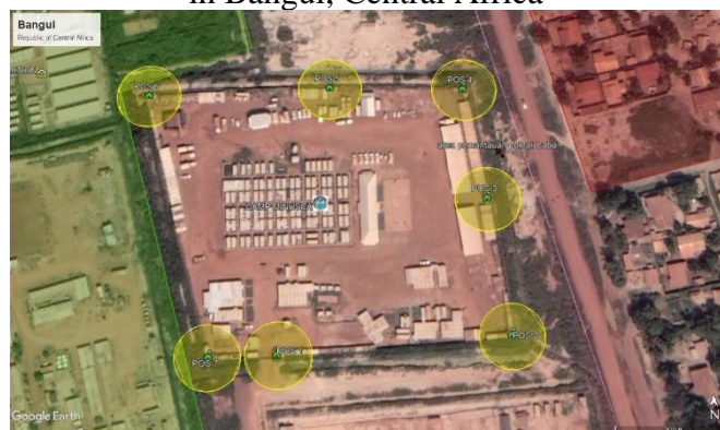
Image 3 Garuda Camp Garbha FPU Task Force at MINUSCA in Bangui, Central Africa