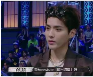
FIGURE 2 你有freestyle(即兴说唱)吗

In the mental and verbal processes, it is a little bit difficult for us to find direct connection between image and the words on the image, but the sentence itself is continue reflecting what the participants are saying or thinking about, see the image above.