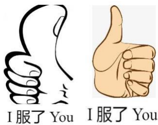
FIGURE 6 I服了You(left and right side)