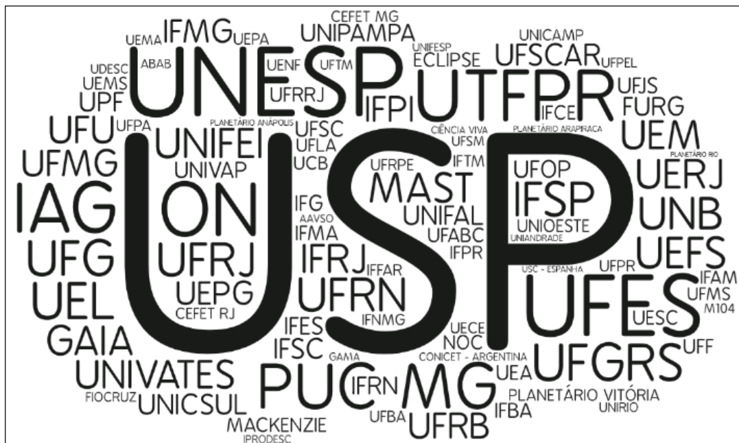
Figure 3 - Home institution of works on non-formal education in astronomy.

The word cloud shown in Figure 3 shows that the University of São Paulo - USP, was the institution with the largest number of works, totaling 41 works; Paulista State University Julio de Mesquita Filho - UNESP, participated with 25 works; the Federal Technological University of Paraná - UTFPR, presented 18 papers; the Pontifical Catholic University of Minas Gerais - PUC MG, had 16 works; the Federal University of Espírito Santo - UFES, presented 13 papers; the Federal University of Rio Grande do Sul - UFRGS, participated in the events with 12 works; the University of Taquari Valley - UNIVATES, had 11 papers and the University of Rio Grande do Norte - UFRN, presented 10 papers. The other institutions presented less than ten papers. Following, we separate the types of institutions and the amount of work of each institution is presented in parentheses.