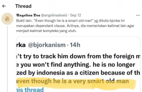
Figure 5. Indoglish Even Though

Bjorka also uses the phrase "Even though he is a smart old man." A dependent clause that requires another sentence to form a complete complex sentence. But Bjorka did not complete the sentence (Figure 5).