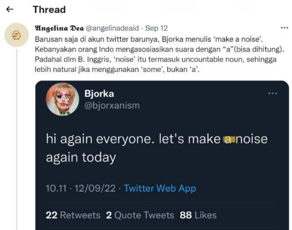
Figure 6. Indoglish a Noise

Bjorka, like most Indonesians, wrote "make a noise." The word "noise" is an uncountable noun, so it is more natural to use "some" instead of "a".