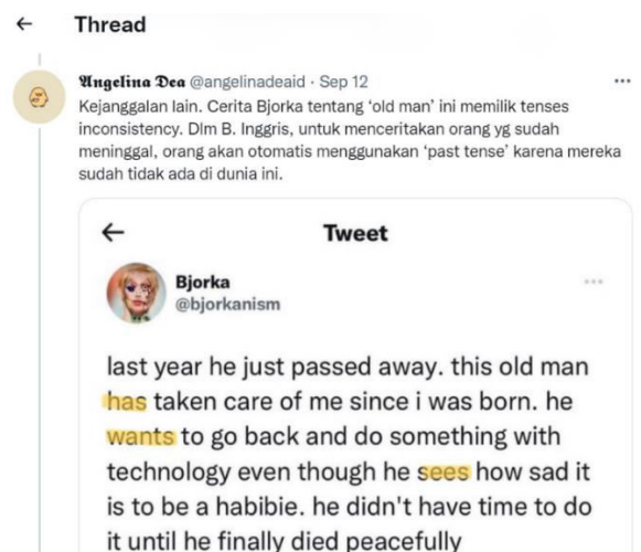
Figure 7. Indoglish This Old Man Has