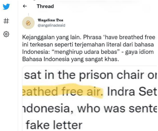
Figure 4. Indoglish Have Breathed Free Air

Apart from "because since," Bjorka also uses the phrase "have breathed free air." A typical Indonesian idiom style "breathing free air" (Figure 4).