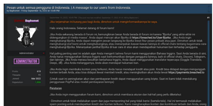
Figure 1: https://breached.co/

trying to arrest Bjorka. However, many Indonesian people sympathize with Bjorka. He is considered a 'hero'.